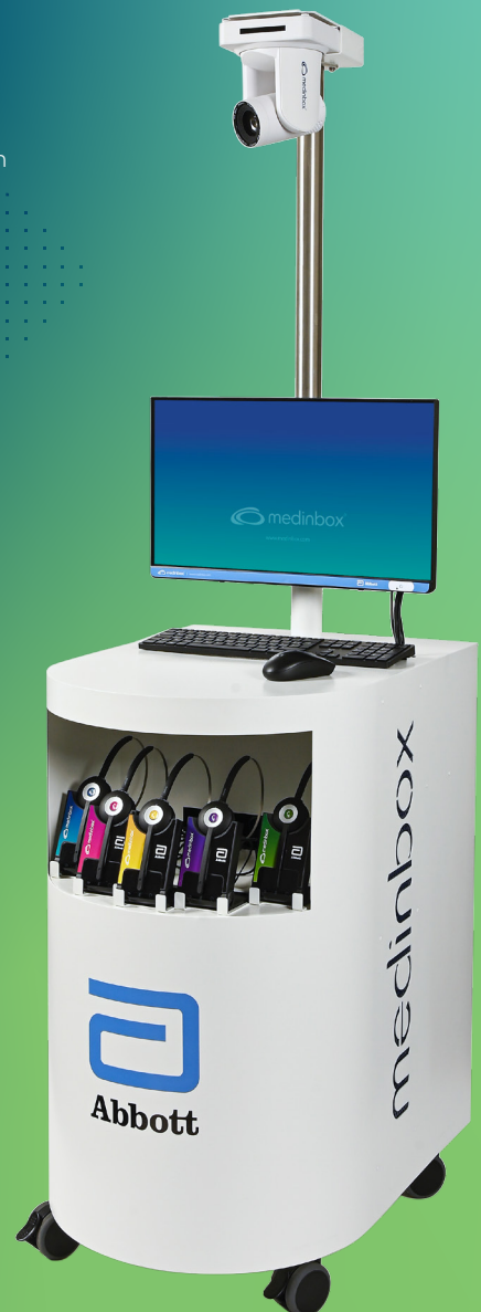
Medinbox‡ Mobile Configuration