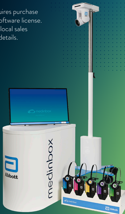
Medinbox‡ Fixed Configuration

Medinbox operation requires purchase of an annual 12-month software license. Please consult with your local sales representative for more details.